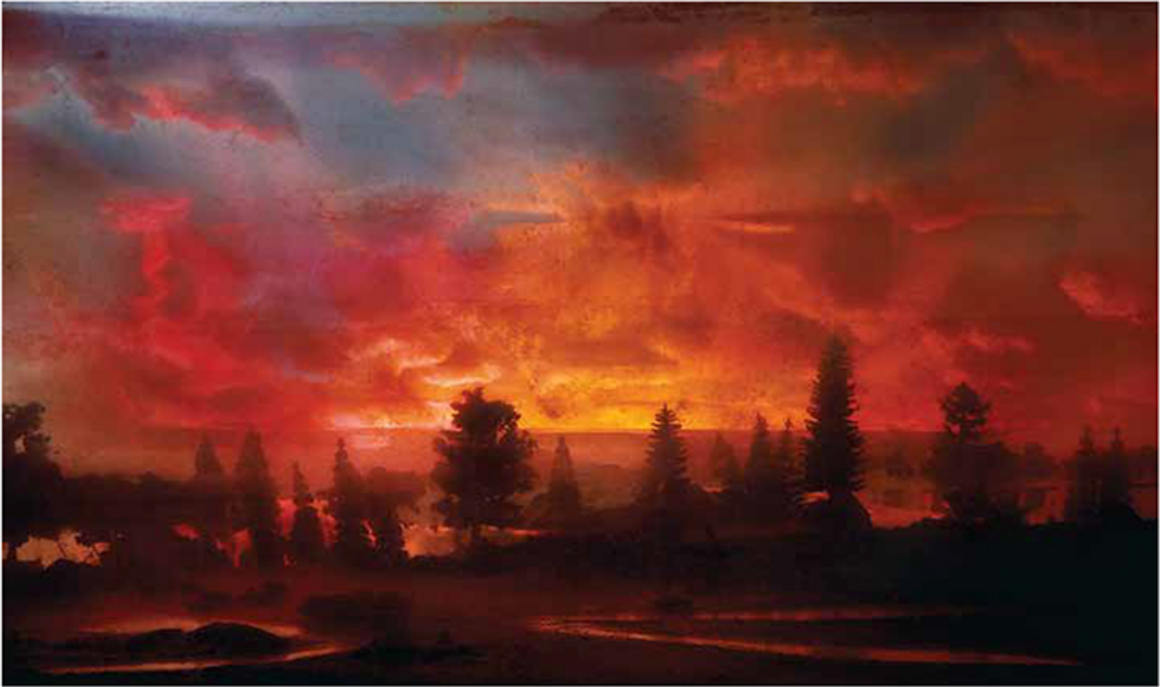
Sunset 44d, 2007.

that eroded over time under water, which he photographed in progressive stages of decay. He then did the same for a sculpture of a human head, which perished similarly. Lately, he's been experimenting with placing still life elements in the tank and letting the paints swirl around them. One of these was recently commissioned by The New Yorker , as an illustration for an article about edible seaweed. "They brought this big bag of seaweed from Connecticut," says the artist, "and I just put it in the tank." The result looks like the "forest primeval" displaced to the floor of the ocean. Keever also did a record-album commission last year; he did the design and illustration for indie-rock neo-folk musician Joanna Newsom's Diver , which includes several tipped-in miniature versions of Keever's most recent series of paint photographs. His works also appear in Newsom's video for the album, directed by Paul Thomas Anderson (of The Master and Boogie Nights fame).