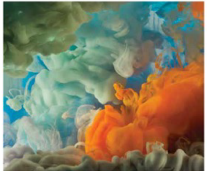
Clockwise from top left: Abstract 7830 , 2014; Abstract 10166 , 2014; Three Vases 17788 , 2015.