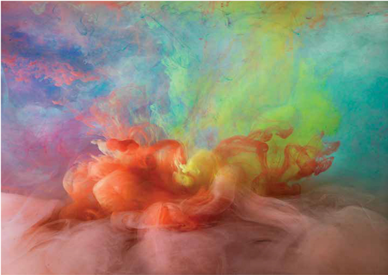
From top: Abstract 14858 , 2015; Abstract 11192b , 2014.